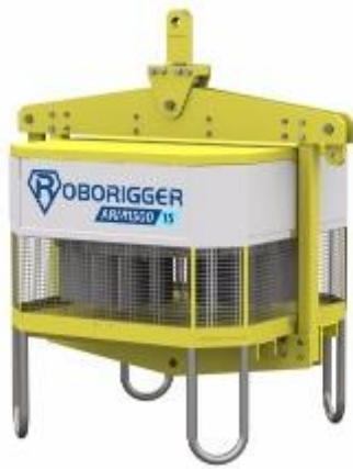
Roborigger modular rotator with lifting frame

The ROBORIGGER Wireless Release system allows the operator to release the load remotely by wireless. The system has inbuilt safeguards to prevent release under load and has a dual command system requiring 2 buttons to initiate a release. Roborigger includes a video camera and load cell and is fully internet connected by wifi or 3g/4g so that all lifts are recorded on the internet database complete with date, time, location, weight and a high resolution image. Load ID can also be recorded.