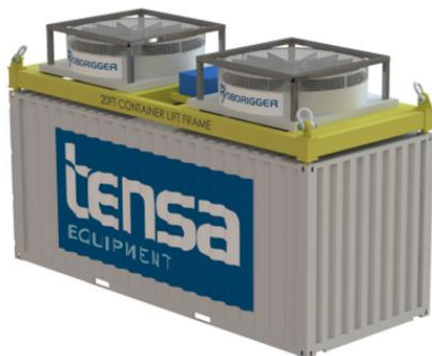
Roborigger ARM modules on lift frame