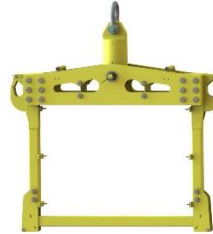
35t WLL Lift Frame