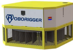
ARM1500 Modular Orientation Controller

The Roborigger ARM1500-35 is a load controlling system based on the ARM1500 load control module fitted with a 35t WLL spreader and hook system. The ROBORIGGER ARM1500 modularised system allows the rotating and orientation system to be independent so that there is great flexibility to provide tailor made lifting configurations.